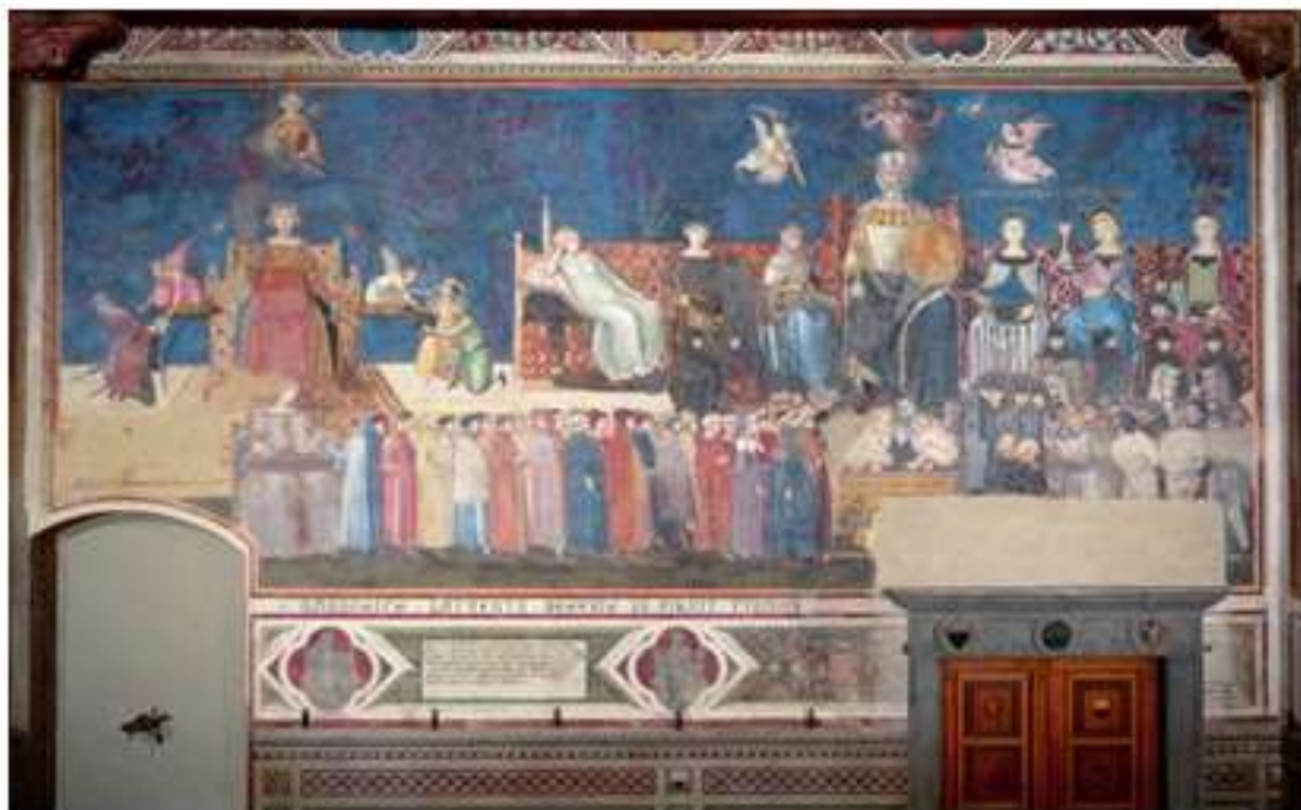
Allegory of Good Government