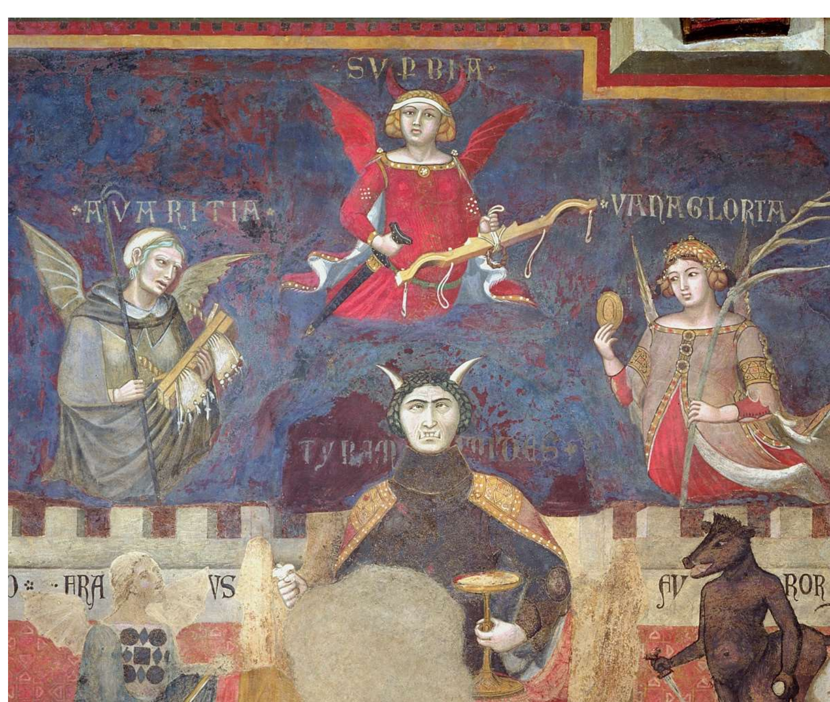
Avarice, Pride Vainglory