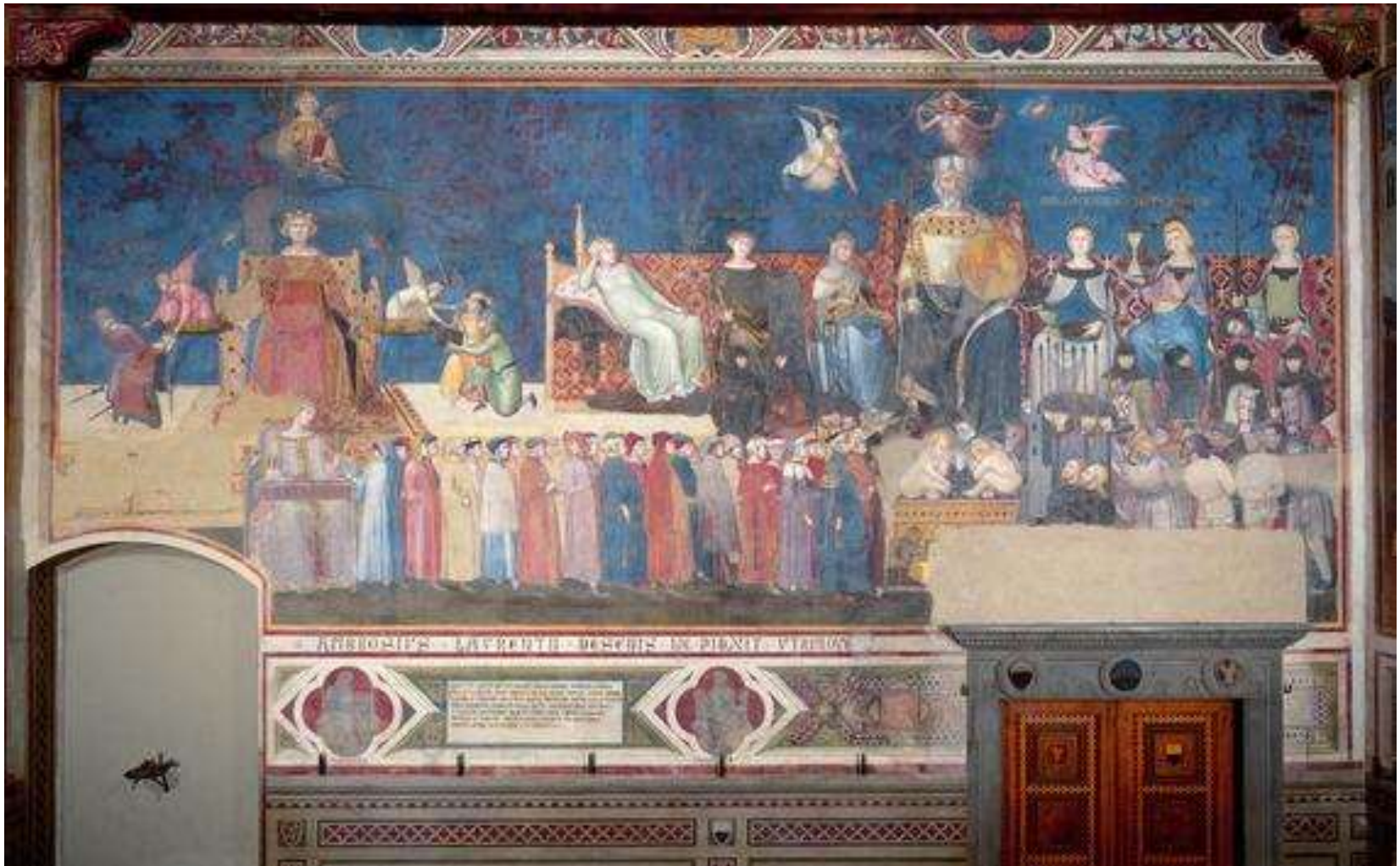
Allegory of Good Government