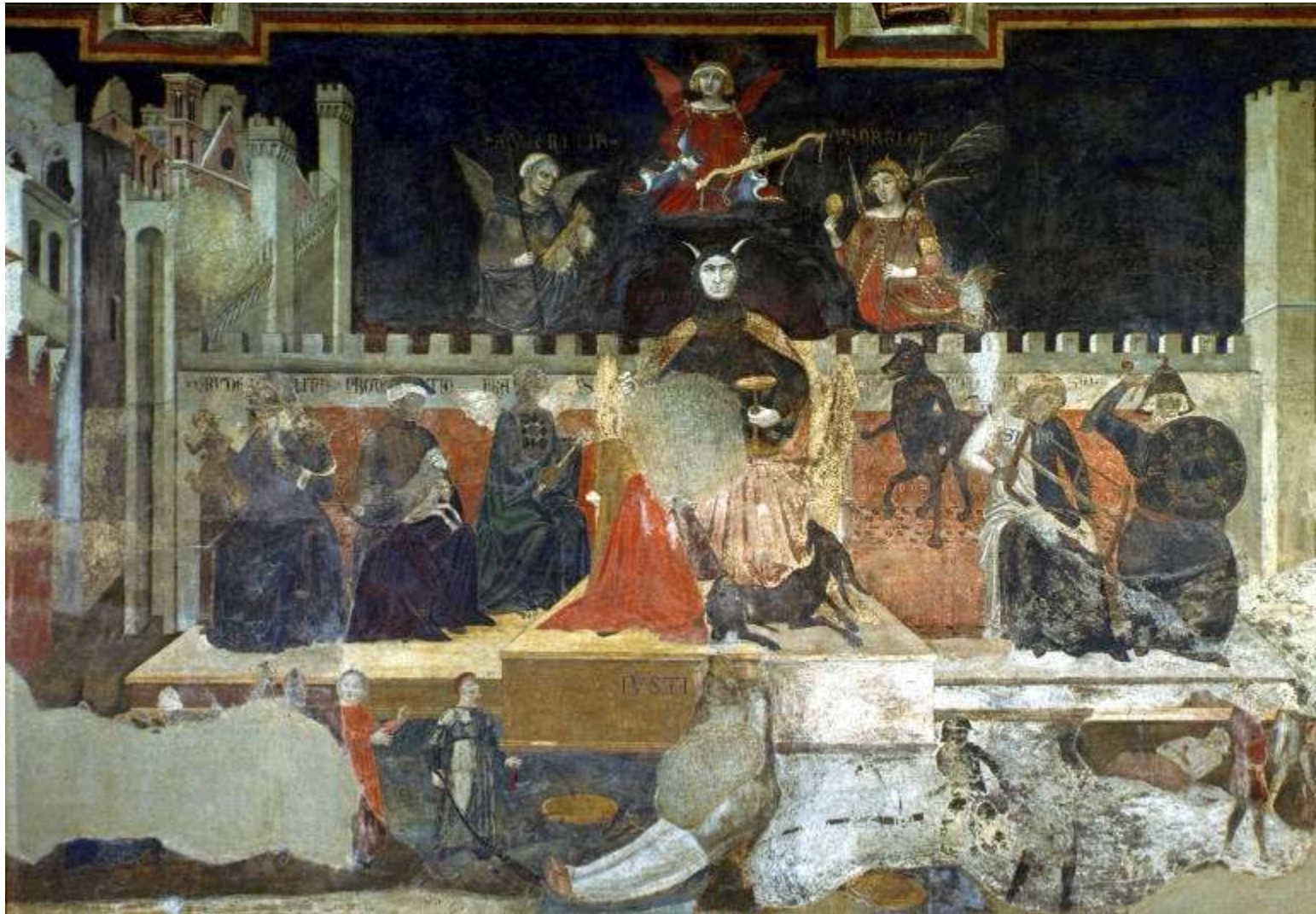
On Left: Cruelty, Treason, Fraud On right: Fury, Division and War Below: Corpse of Justice