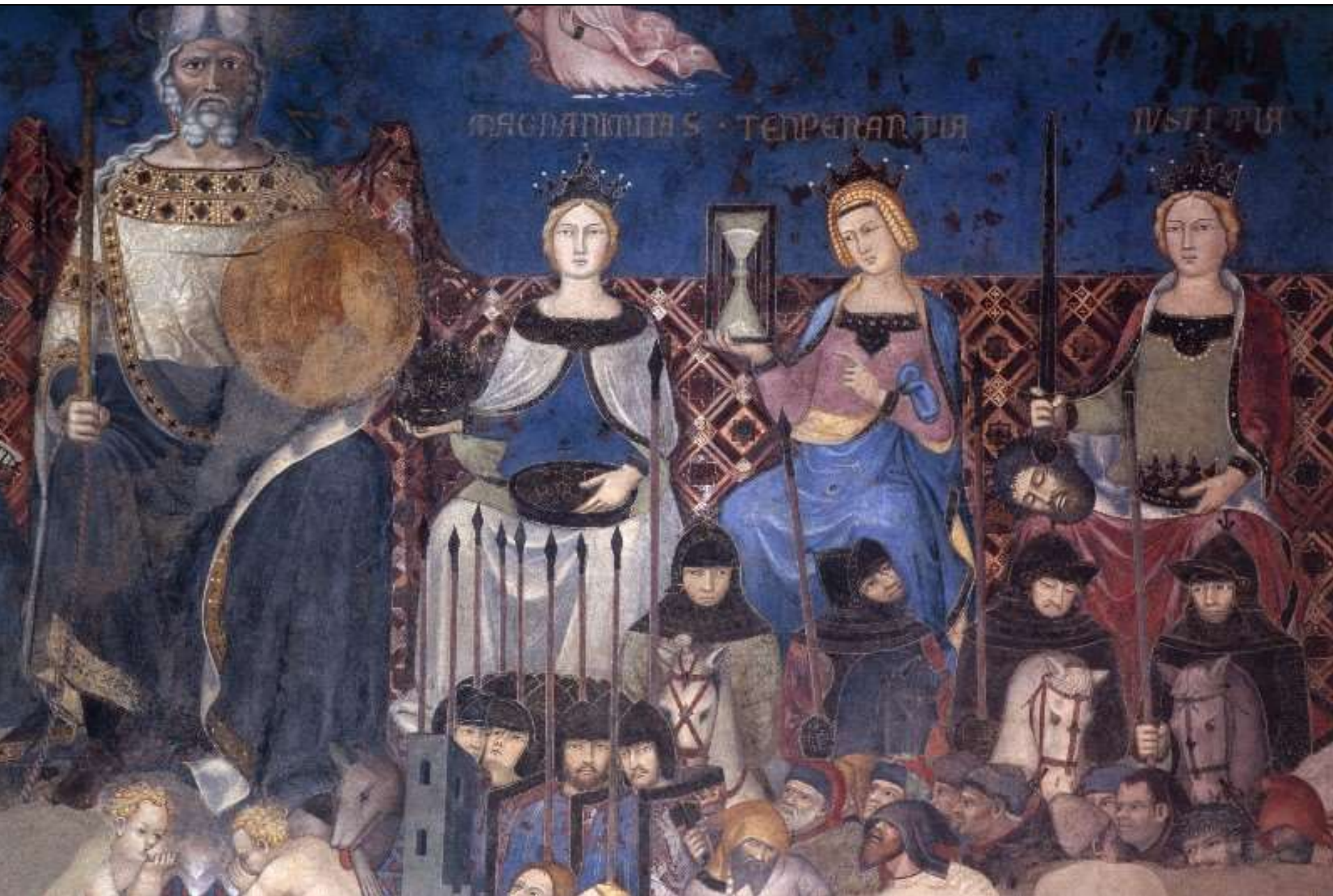
Below: She Wolf with Romulus & Remus Right: Magnanimity, Temperance, Justice