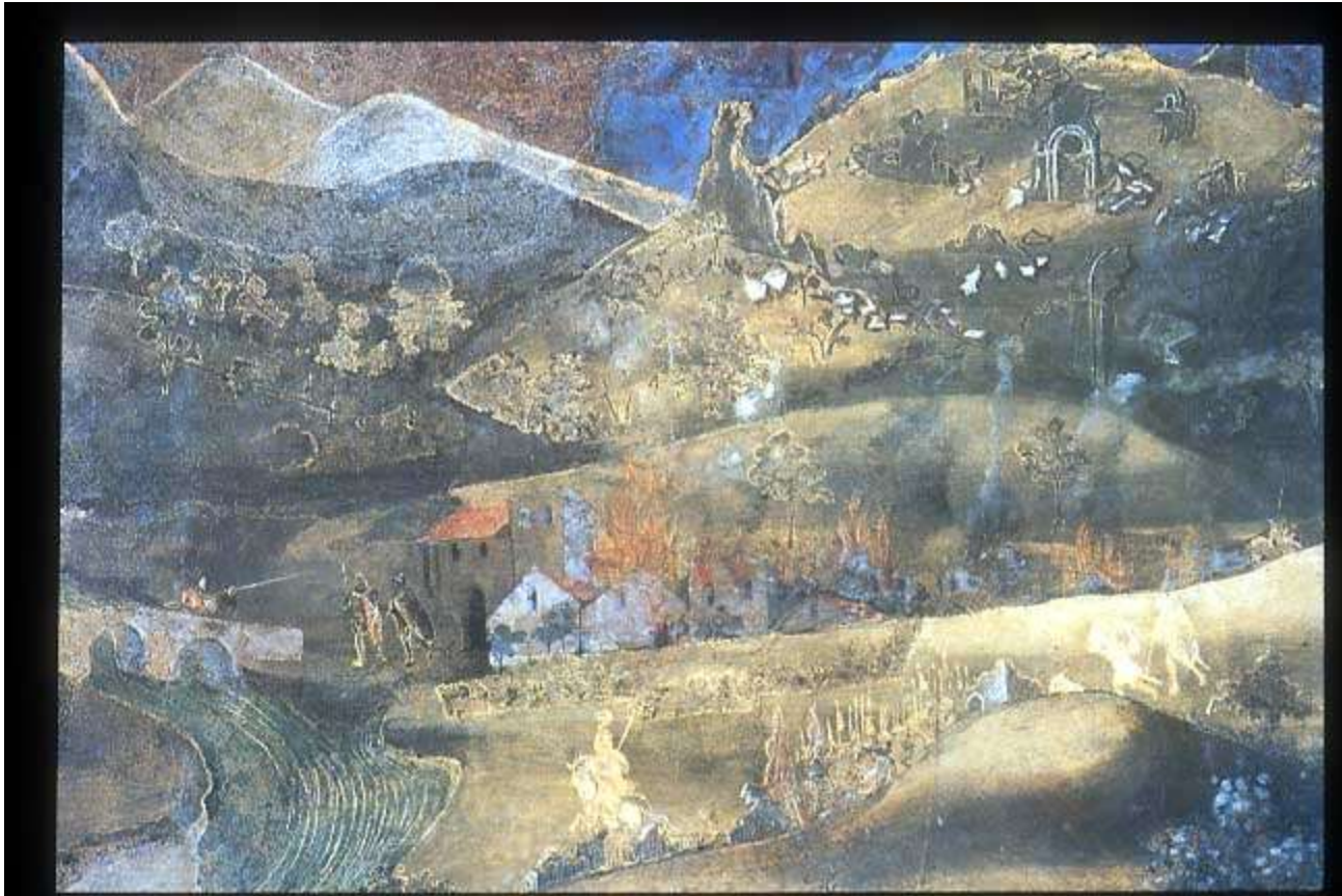
Desolation in the countryside