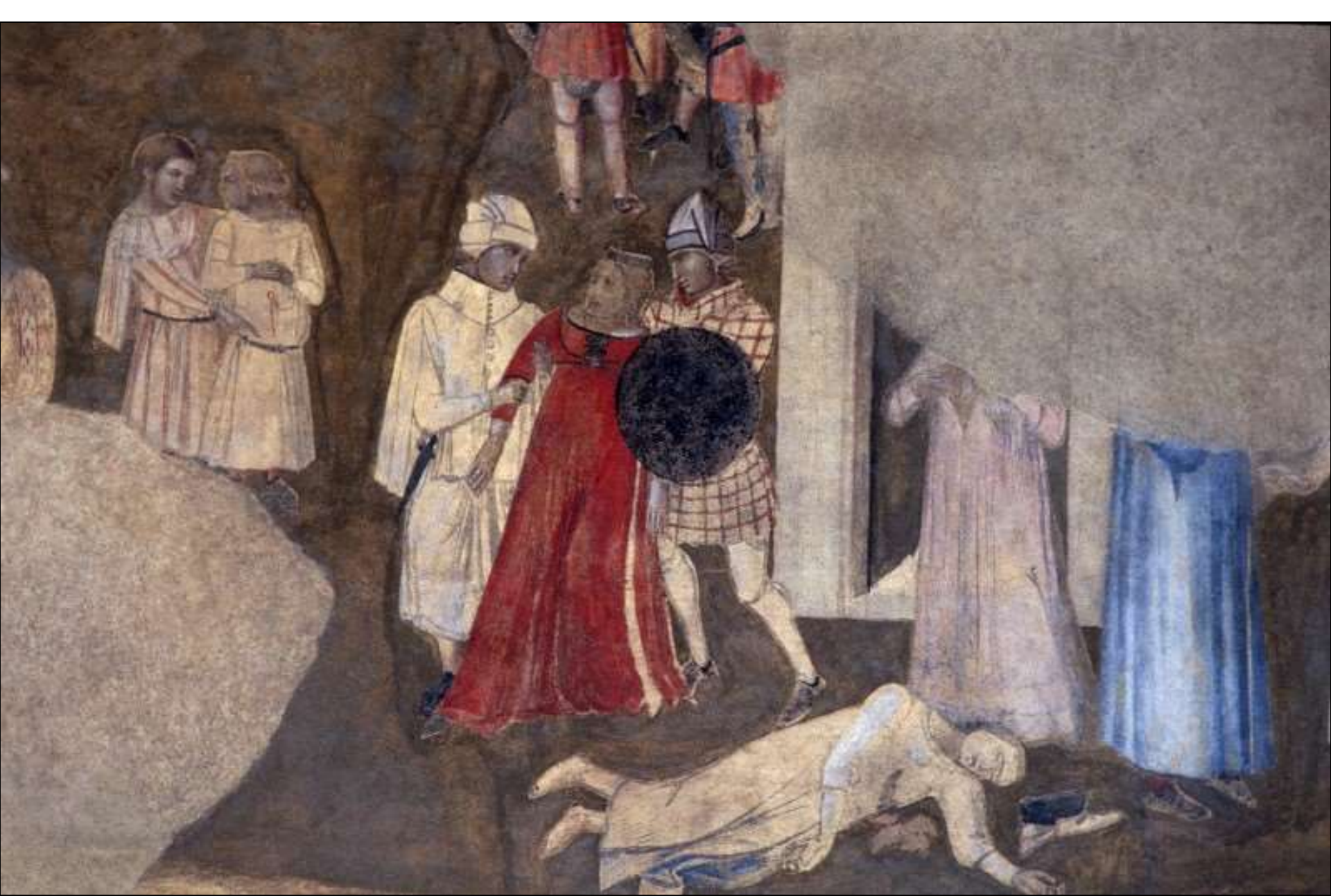
Violence in the city