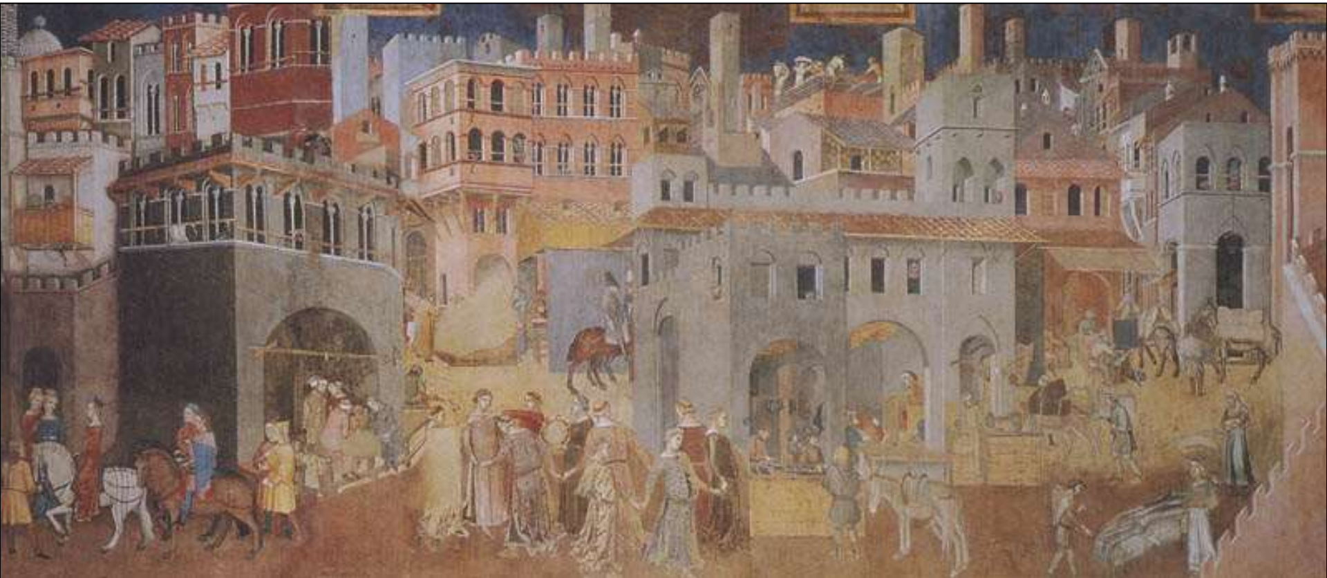
Effects of Good Government in the City