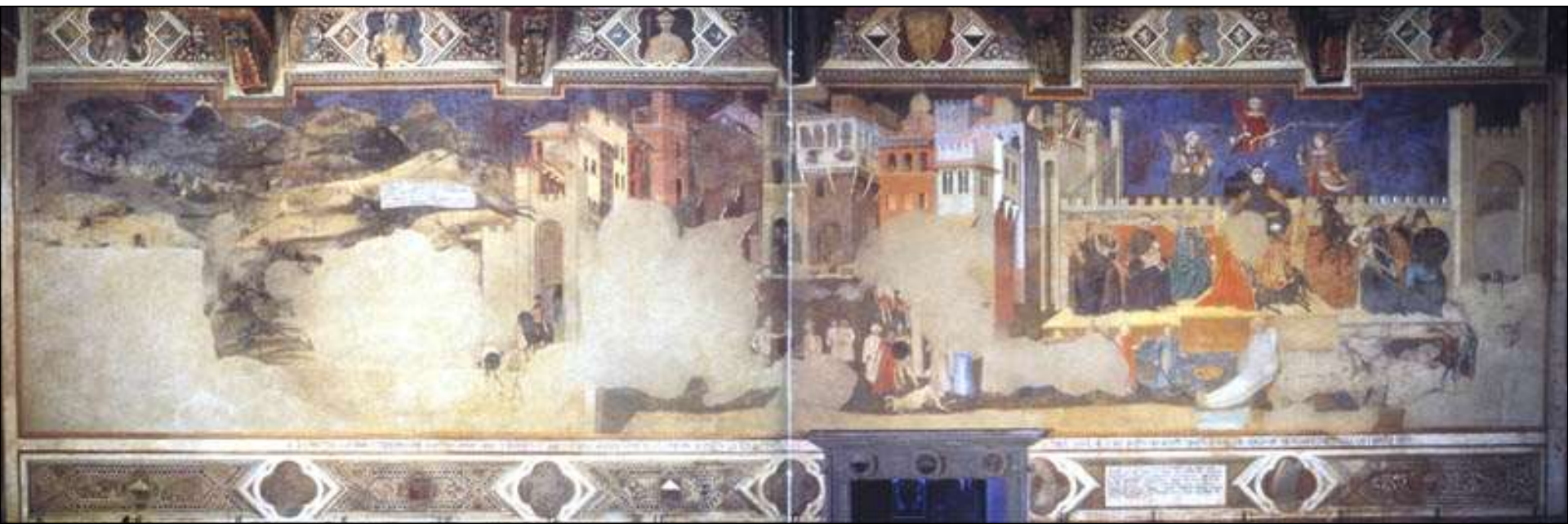
Effects of bad government in the city