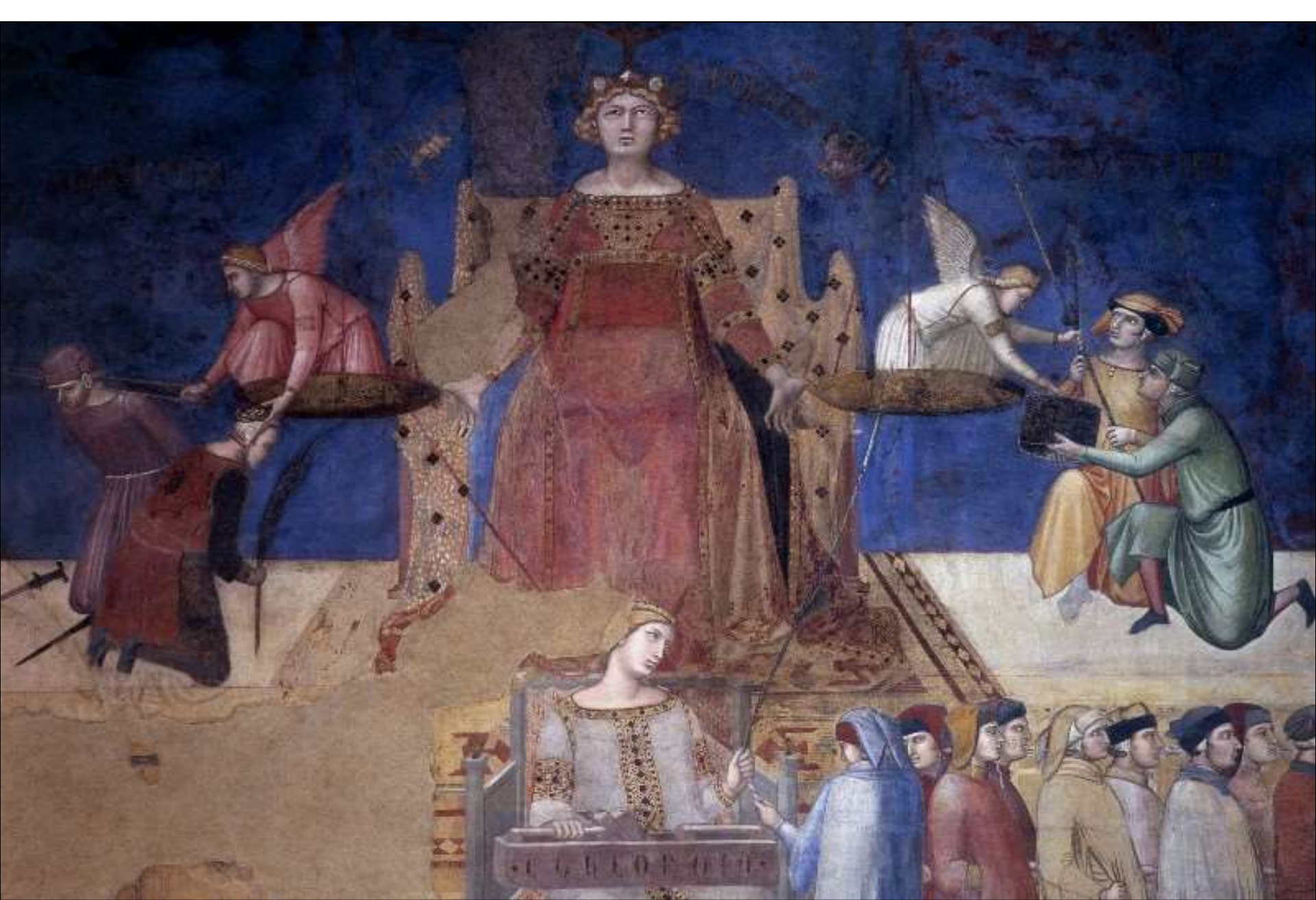
Justice enthroned: Distributive (left) and Commutative (right) Below: Concordia