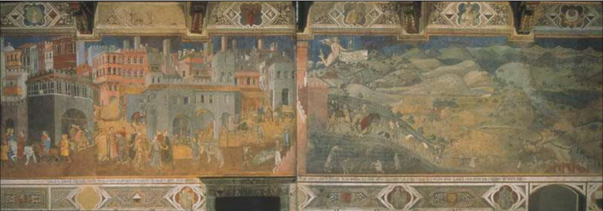
Effects of Good Government in the City