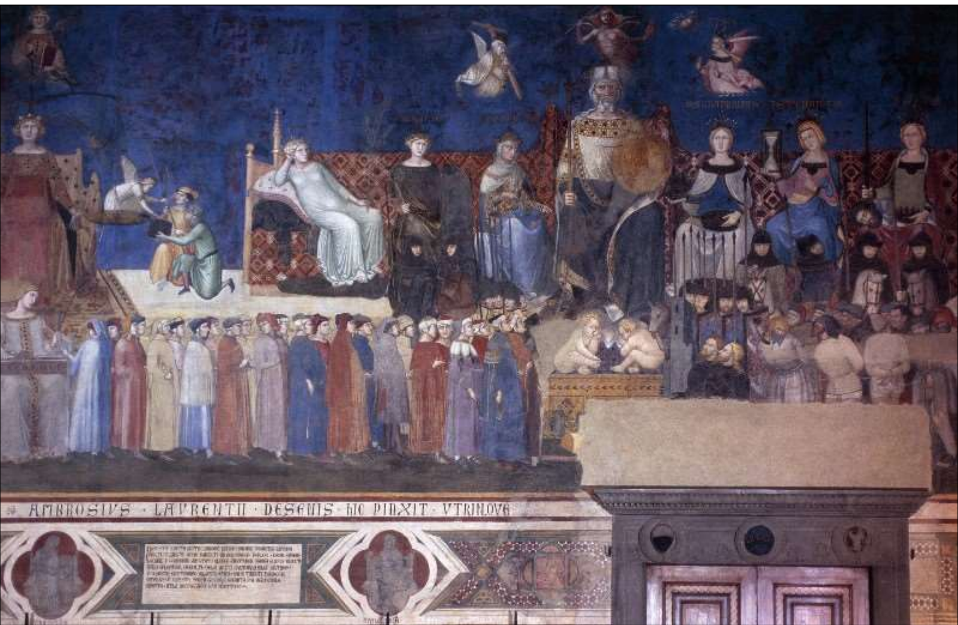
Right: Divine Wisdom with the theological virtues of Faith Hope and Charity