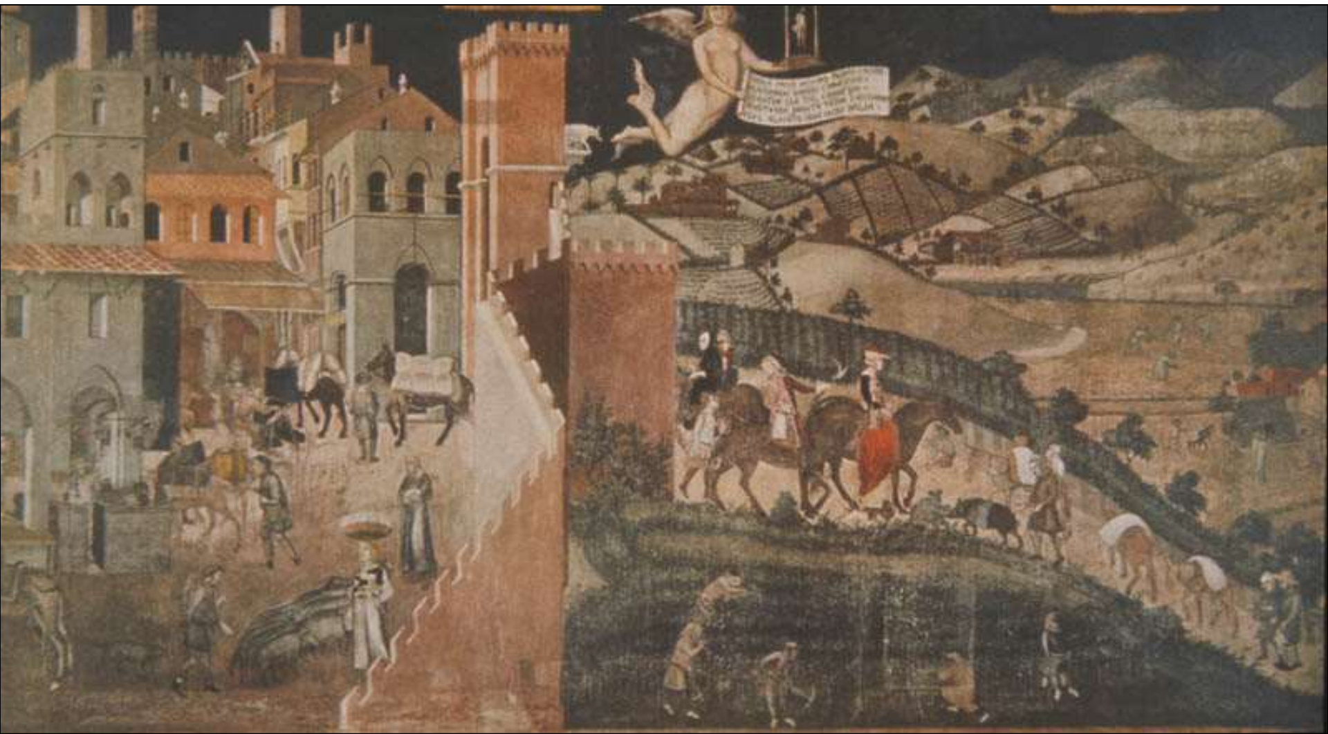
City wall with Angel of Security